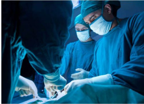
Spine procedure in process