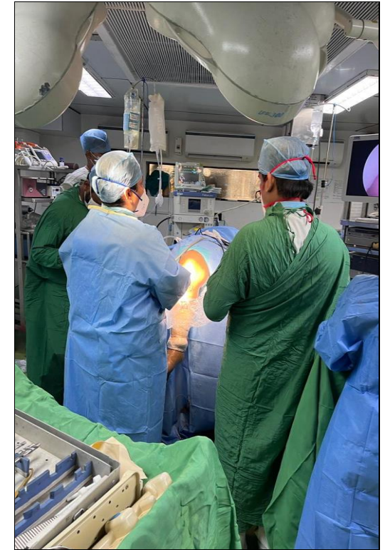
Fotiz Arthro shaver in action

2 nd Floor, Plot no 165/1/17, Priyadarshini Industrial Society, T block, MIDC, Bhosari Pune 411026